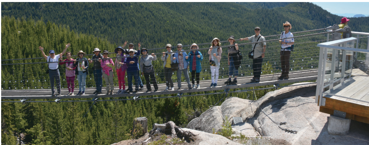
An outing to the Sea to Sky Gondola in Squamish, BC with members of our chapter.